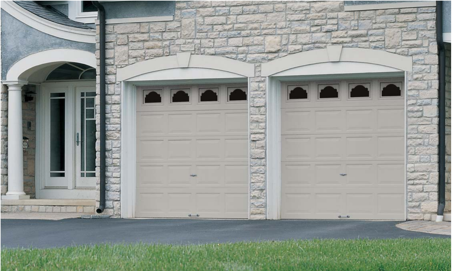
Model 8100 shown in Colonial design with Cathedral I window inserts.